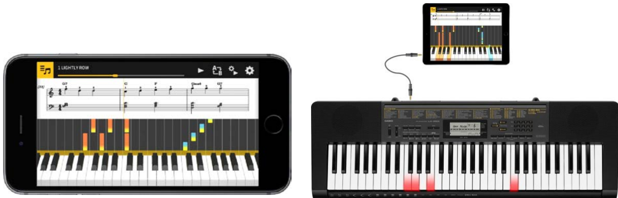
Photo: The „Chordana Play“ app on smartphone and connected to a lighted keys keyboard.

The keyboards CTK-3500, CTK-2500 and LK-265 can be connected with the new "Chordana Play" app, which was developed by CASIO and is available for iOS and Android since March, by using a smartphone, tablet or smart devices. The free app assists beginners in learning how to play a keyboard and enables advanced users to expand their repertoire and add Standard MIDI files to their music library.