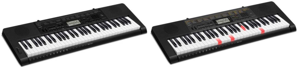
The models CTK-3500 and LK-265

Norderstedt, Germany, April 4th, 2017. At this year's Musikmesse in Frankfurt, CASIO presents its new standard keyboards CTK-3500, CTK-2500 and CTK-1500, as well as the lighted keys keyboards LK-265 and LK-135. All new models are equipped with the „Dance Music Mode“ which makes it easy to create own music and mix it with music styles like House, Dance and EDM. Additionally, the „Dance Music Mode“ features four phrase patterns, four different sound effects, and the Build-Up Play function which gives selfmade tracks their finishing touch.