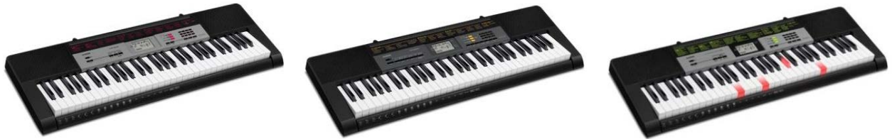
Photo: The keyboards CTK-1500, CTK-2500 and LK-135 are ideal for beginners